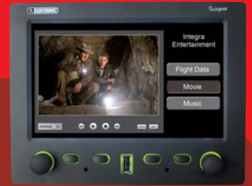
EFIS/EMS REMOTE DISPLAY TL-6824